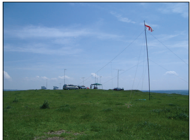
Field Day Antenna Farm on Marten Hill

Last year for the first time members of Derby Raynet held a Field Day. This was a Social occasion and was put on to have a day operating radio. As many members of N.H.A.R.G are also members of Derby Raynet. It was thought that it would make for a good day if we had a joint event.